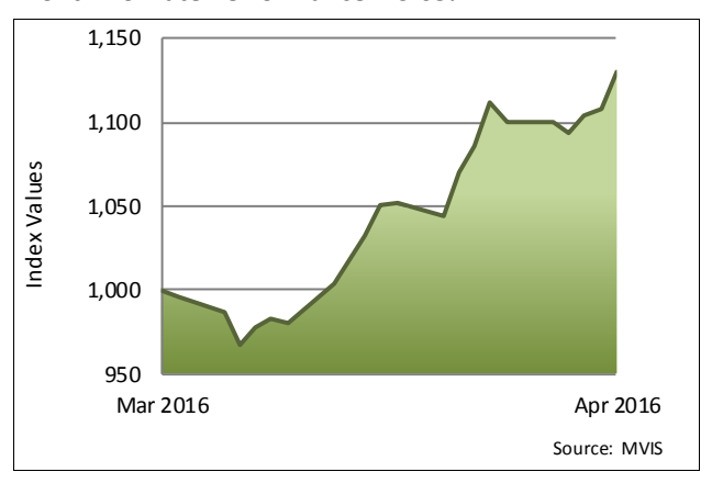
MVIS AU Jr. Energy & Mining Index (AUD) (MVMVETR) Month-To-Date Performance: 13.05%