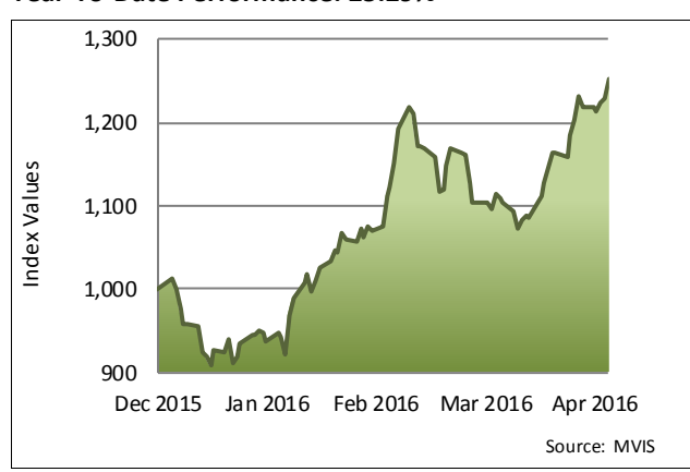
MVIS AU Jr. Energy & Mining Index (AUD) (MVMVETR) Year-To-Date Performance: 25.29%