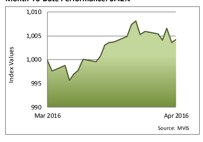
MVIS Glb. Event Long/Short Equity Index (MVEVEQTR) Month-To-Date Performance: 0.42%