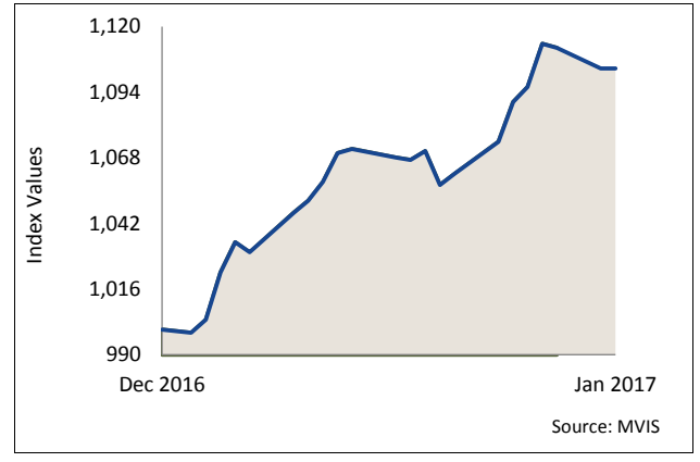
MVIS Global Rare Earth Index (MVREMXTR) Month-To-Date/Year-To-Date Performance: 10.33%