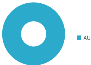
COUNTRY WEIGHTINGS INCL. NON-LOCAL*